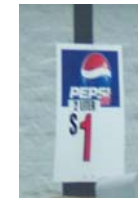
Temporary Changeable Advertisement